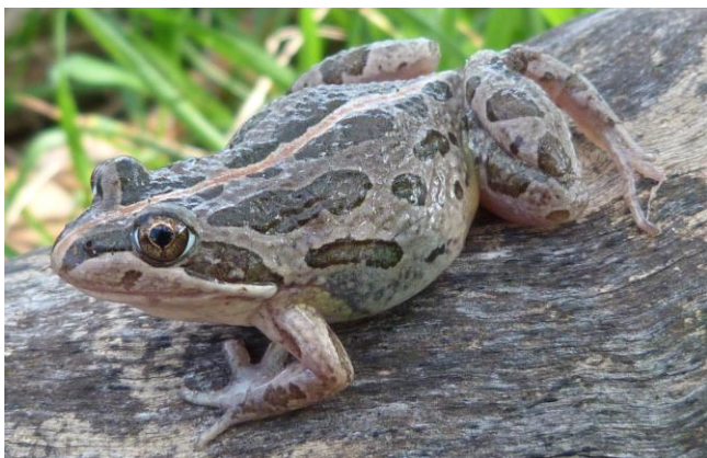
Spotted Marsh Frog ( Limnodynastes tasmaniensis )

The bird hide is located in the south-eastern of the TSR. The bird hide allows visitors to view the many waterbirds and woodland birds that use the area. You can also listen for frogs that spend some of their time in the wetland and woodland area of Native Dog Swamp. Bird and frog identification signage is displayed in the bird hide to help visitors know what to look for.