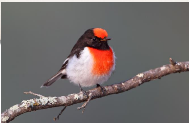
Red-capped Robin ( Petroica goodenovii )