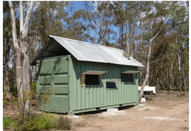
Birdhide constructed at Native Dog Swamp

The bird hide is located in the south-eastern of the TSR. The bird hide allows visitors to view the many waterbirds and woodland birds that use the area. You can also listen for frogs that spend some of their time in the wetland and woodland area of Native Dog Swamp. Bird and frog identification signage is displayed in the bird hide to help visitors know what to look for.